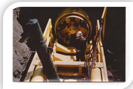
tunnel shield - jacking unit